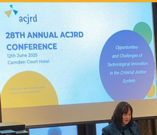
Left: Senator Fiona O'Loughlin speaking about the 'Council of Europe Framework Convention on Artificial Intelligence' at the ACJRD Annual Conference