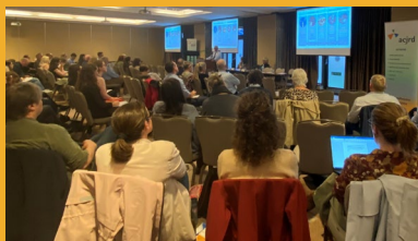
Above: The 28th ACJRD Annual Conference on the theme of 'Opportunities and Challenges of Technological Innovation in the Criminal Justice System'