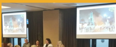
Above: The thematic session on 'Applications of Technology in the Criminal Justice System' at the ACJRD Annual Conference