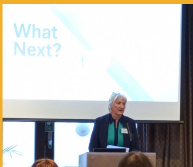
Above: Chief Inspector Jacqui Durkin, Criminal Justice Inspection Northern Ireland, who spoke on 'Transforming the Criminal Justice System in Northern Ireland: A Strategic Overview' at the ACJRD Annual Conference

HELP is the main educational Programme of the Council of Europe for legal professionals. Its aim is to train judges, prosecutors and lawyers, but also other professionals, where relevant, on European human rights standards. As well as the European Convention on Human Rights (ECHR) and the case-law of the European Court of Human Rights, HELP covers other Council of Europe instruments such as the European Social Charter or CoE Conventions in key areas like data protection, violence against women or bioethics. In order to access them, you will need to create a HELP account (click here to create/login to your HELP account ). To view the catalogue of courses click here .