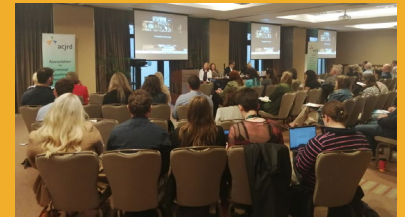
Above: The 28 th ACJRD Annual Conference on the theme of 'Opportunities and Challenges of Technological Innovation in the Criminal Justice System'

Policing and Society Conference 'De-escalation' [1-2 October, Iceland] call for abstracts. Deadline: 15 August 2025 .