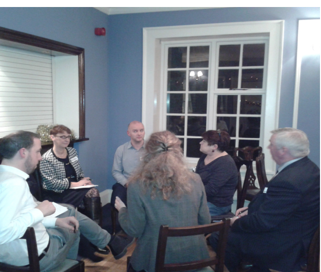
ACJRD Working Group members in discussions at the Networking Event.